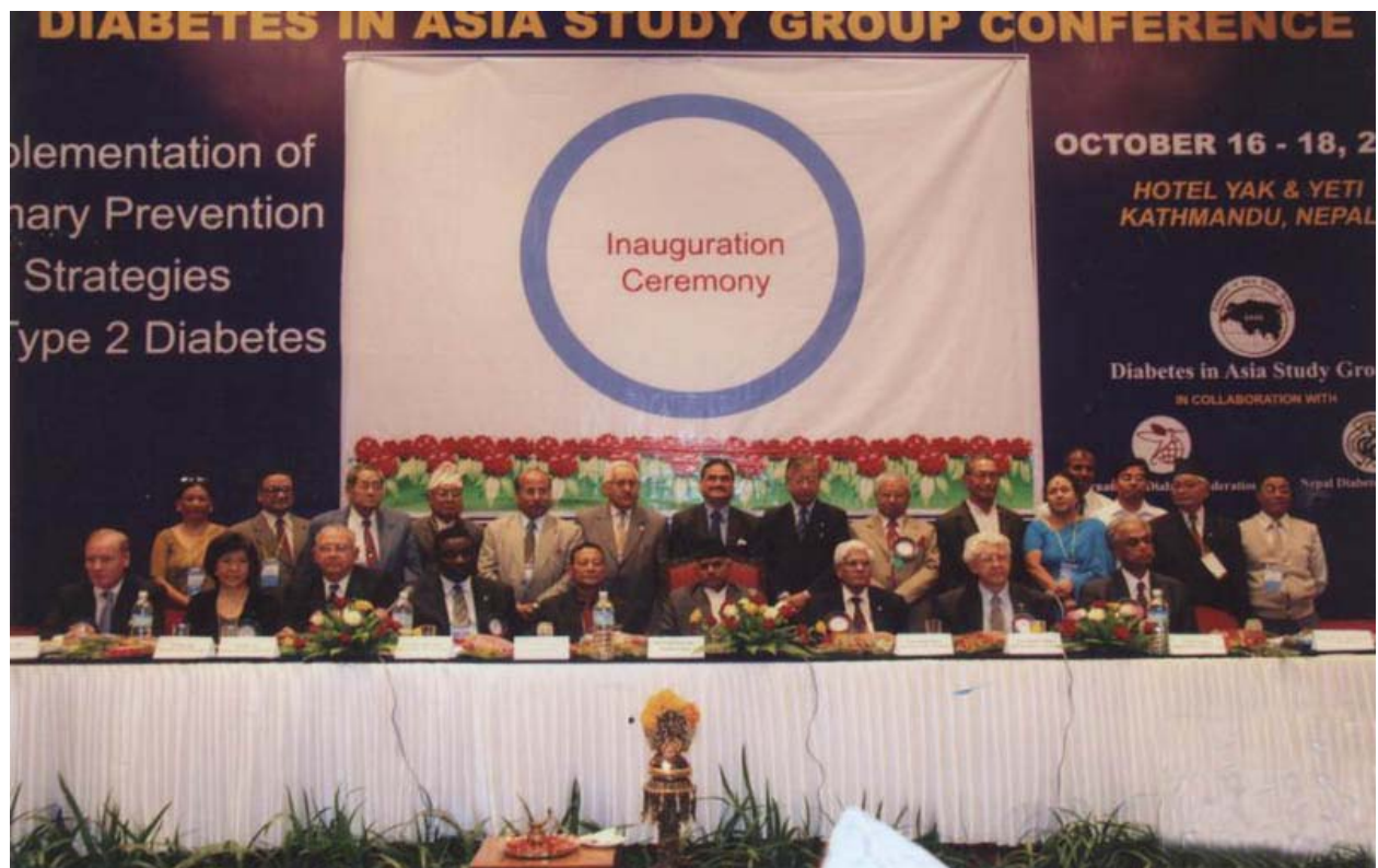
Delegates with Nepal President

A large number of papers, covering diverse subjects related to diabetes research and practice within the regions of Asia and The Middle East, were presented. A copy of the full programme can be downloaded from the web site, provided the speakers agree we plan to make the papers presented to be available on the web site.